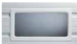
24" X 12" SINGLE PLEXIGLAS® 24" X 12" INSULATED PLEXIGLAS®