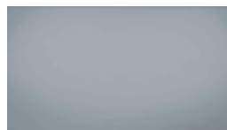
ALUMINUM FULL VIEW*