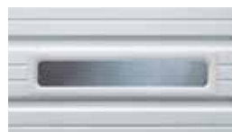
24" X 6" DSB or PLEXIGLAS®

Available with either a black or white frame.