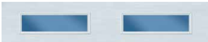
41" x 13" LONG PANEL*

*True White shown; also available in Almond, Wicker Tan, and Sandtone. Available with Clear, Obscure, or Insulated glass.