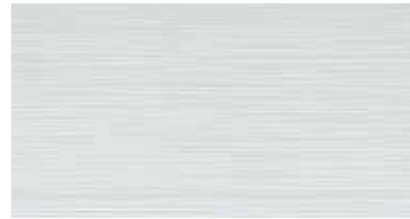
FLUSH PANEL WITH WOODGRAIN EMBOSSMENT