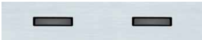
24" X 6" DOUBLE INSULATED ACRYLIC**